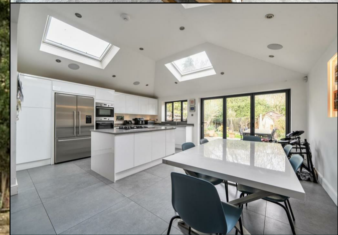
Laurel View, Woodside Park, N12 7DT Guide Price £1,195,000 Freehold Council Tax Band F